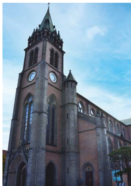
Church located in Seoul

4. The above photograph from Seoul, South Korea predominantly shows the diffusion of _____ in the cultural landscape.