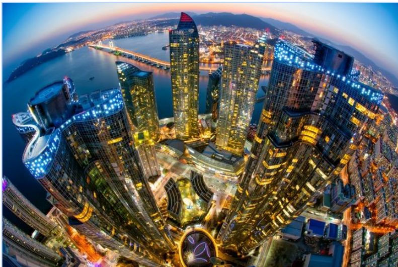
Photograph of contemporary urban South Korea (Busan)