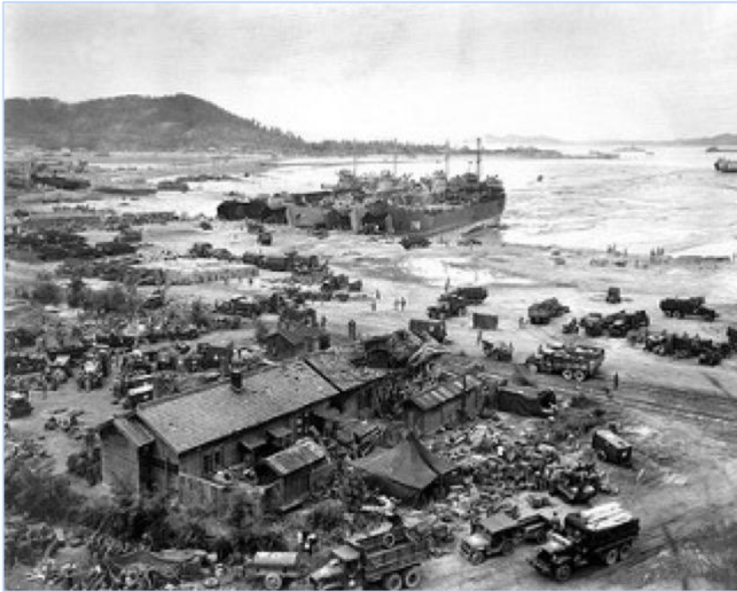
Photograph of the Inchon landing in 1950